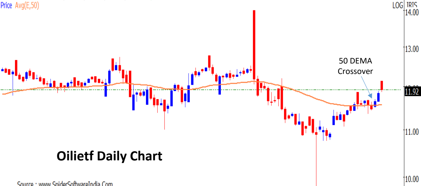
Oilietf Daily Chart

OILIETF [N24533] 12.13, 12.13, 11.86, 11.92, 2632013, 0.68% Price Avg(E,50)