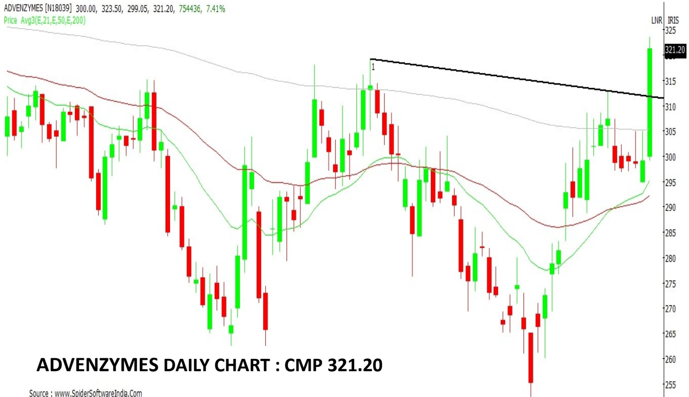
ADVENZYMES DAILY CHART : CMP 321.20

ADVENZYMES [N18039] 300.00, 323.50, 299.05, 321.20, 754436, 7.41% Price Avg3(E,21,E,50,E,200)